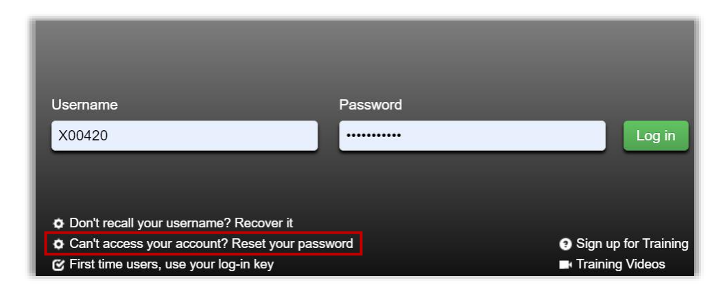
Figure 1: Link to reset password

Metrc makes it easy for users to reset their passwords without the need to contact support for assistance. On the login page, click the link with a white gear icon next to it that reads Can't access your account? Reset your password as seen in Figure 1 .