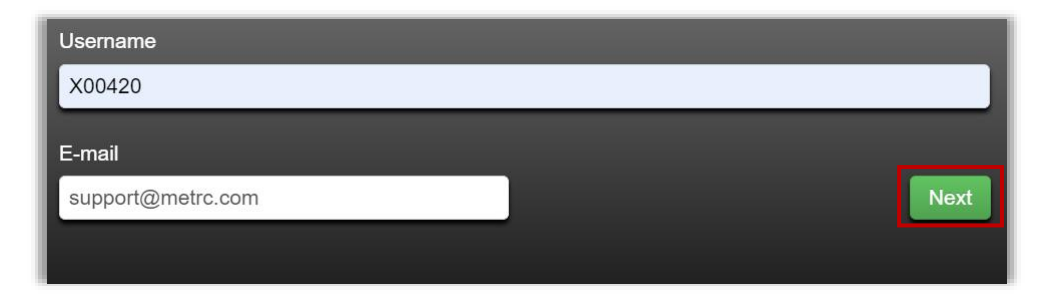
Figure 2: Required Username and E-mail fields

You will be redirected to a page requesting your Username and E-mail. Fill these in and click the green Next button as seen in Figure 2 .